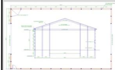
Post Layouts, Wall Sections & Detail Drawings