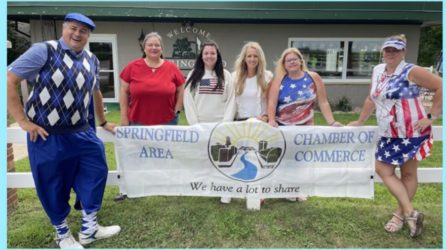
Springfield Chamber of Commerce General Board