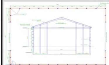
Post Layouts, Wall Sections & Detail Drawings