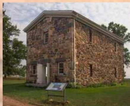
Redwood/Lower Sioux Agency

Tickets: $60 (Includes site admissions & lunch at Pizza Ranch, Redwood Falls) Bus boards at the Brown County Museum at 9:00 AM. and will return around 4:30 PM. For more information contact Brown County Museum at: (507) 233-2616 or e-mail education@browncountyhistorymn.org