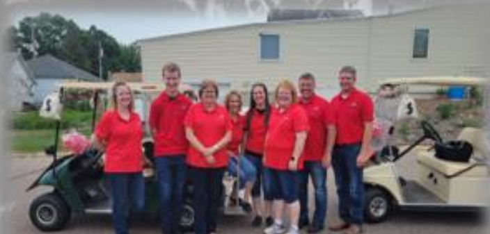
Our Team Members