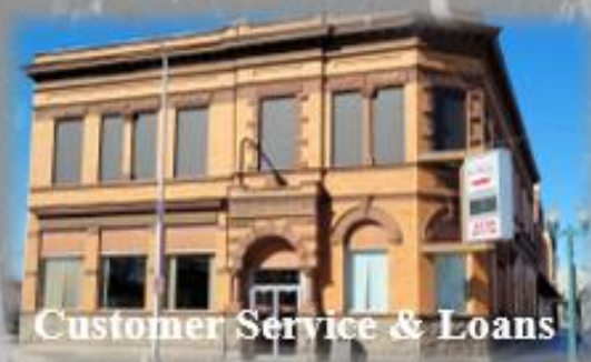
Customer Service & Loans

Serving our communities – Past Present Future