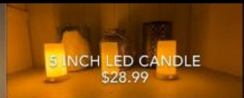
5 INCH LED CANDLE $28.99