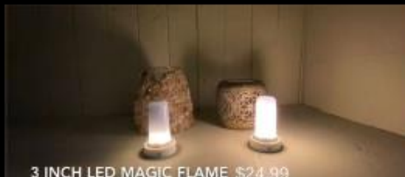
3 INCH LED MAGIC FLAME $24.99