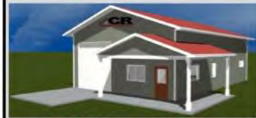
Shop House and Shop Office Options