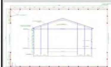
Post Layouts, Wall Sections & Detail Drawings