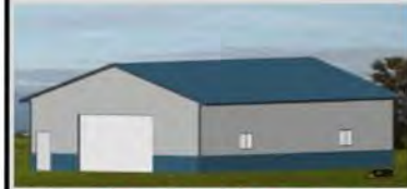
Machinery Storage Options