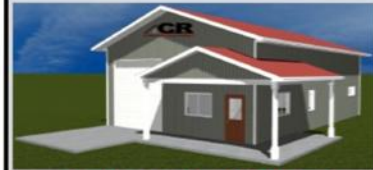
Shop House and Shop Office Options