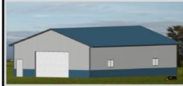
Machinery Storage Options